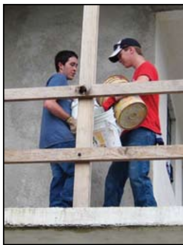
In 2010, our students were in mission in Lake Charles, La., San Marcos, and Guatemala.

Our senior high students will be working with the Tennessee Conference of the